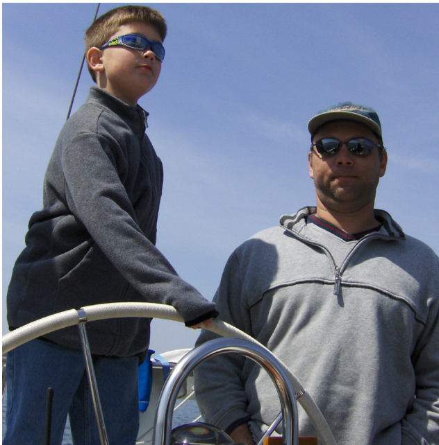
Youth Sailing Marchand style